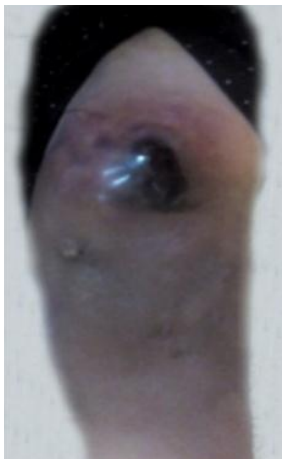
Fig.9: Infected graft of the forearm loop

In the forearm loop group only a diabetic patient, 1/11, developed seroma (9.1%) one week postoperatively at the transverse segment of the graft (at the wound of the counter incision). She was managed by repeated dressings, compression and antibiotics. Seroma subsided over 2 weeks. After 2 months of effective dialysis through the constructed graft, the patient developed an abscess 3.7x1.5 cm on the transverse segment of the loop (the same site of previous seroma). The abscess was treated by limited drainage and the wound healed over 12 days of repeated dressing and antibiotics with continuation of hemodialysis from the graft for another month. Two weeks later, she developed severe infection at the site of the anastomosis and unfortunately, the fistula had to be ligated. There was no recorded cases of the same complication in the BBAVF group. The difference in the incidence of infection (one in the loop group vs zero in the BBAVF group) was statistically insignificant ( p=0.3 ). ( Fig. 9 )