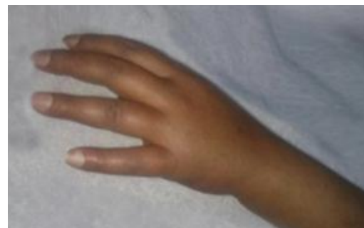
Fig. 8: Improvement of venous hypertension post PTA