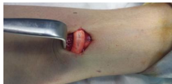
Fig. 2: The graft passed through the tunnel