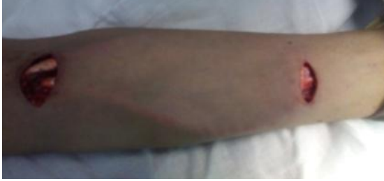
Fig. 4: The wounds before closure

Prophylactic antibiotics (e.g. cefuroxime 1.5 g i.v.) was administered, the patient was generally anaesthetised and positioned supine. Brachial artery and the median antecubital vein were dissected free. Notably, the median antecubital, basilic, cephalic, or deep veins can be used for the venous anastomosis; with the choice was based on the size and quality of the respective veins. The incision was transversely positioned 1 to 2 cm distal to the antecubital crease, and small skin flaps were elevated to expose the vessels. The proposed course of the prosthetic access was drawn over the forearm skin and the graft is draped over it to confirm that there was sufficient length. A small counter incision was made over the proposed course of the graft at approximately the 6 o'clock position with the antecubital crease being 12 o'clock. A tunneler was passed through the subcutaneous plane along the proposed access course, with an attempt to make the tunnel somewhat deeper near the antecubital incision and counter-incision than the rest of the course of the graft. A 6-mm expanded PTFE grafts was passed through the tunnel and then filled with saline to confirm that the graft followed a continuous, unobstructed course. The venous and arterial anastomoses were completed, sequentially using 5-0 expanded PTFE vascular suture. The wound was closed with subcutaneous polyglycolic acid sutures (vicryl® Jonson & Jonson Inc.USA), without drain insertion followed by occlusive dressing.