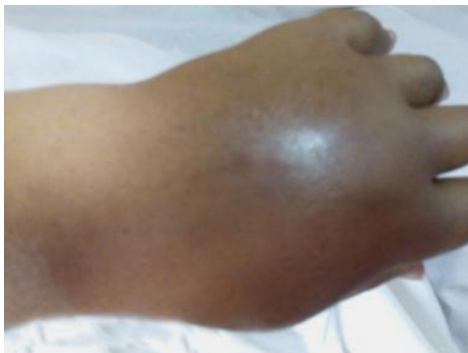
Fig.5: Venous hypertension post BBAVF

In the BBAVF group, only one patient, 1/13, developed venous hypertension (7.7%). This patient suffered from hand oedema 4 months after surgery and duplex showed occlusion of the innominate vein. She underwent balloon dilatation. (Figures. 5-8) Oedema subsided gradually over a week following the procedure. There were no recorded cases of venous hypertension in the forearm loop group; and the difference was statistically insignificant ( p=0.3 ).