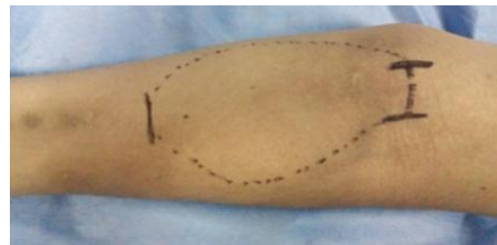
Fig. 1: The expected tunnel was drawn over the skin

For Forearm loop graft (the study group): (Figures 1-4)