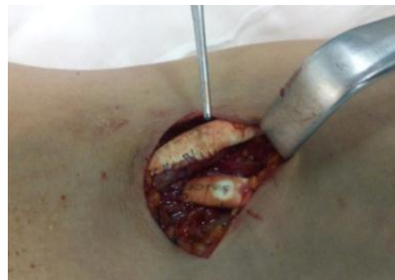
Fig. 3: The venous and arterial anastomoses