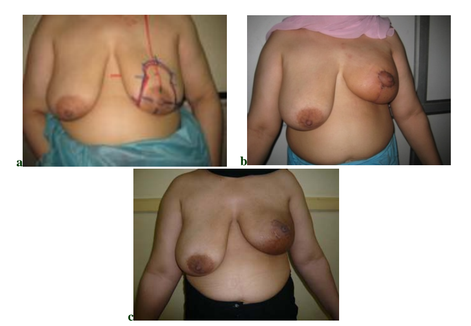
Fig. 1: Patient presenting with a mass in the upper outer quadrant of the left breast. The mass is away from the edge of the areola by 3cm. a-c reduction mammaplasty technique (medial pedicle = Hall Findlay mammoplasty); a) preoperative marking, b) 1 week postoperative and c) post radiation therapy.