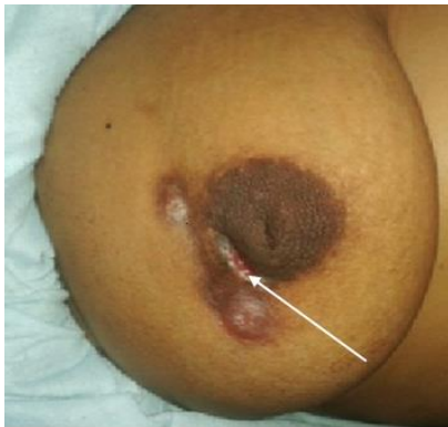
Figure 1. Right breast of an IGM patient before treatment, showing multiple mammary duct fistulae and non-healing wound (skin ulceration) after drainage of an abscess (white arrow). Informed consent was obtained from the patient to print this photograph.

**The case managed with antibiotics plus steroids with wide resection is the one which was refractory to antibiotics plus steroids with incision and drainage