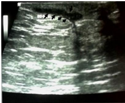
Figure 4. Breast ultrasonography shows an ill-defined, irregular tubular, hypoechoic lesion (black arrows), consistent with IGM.