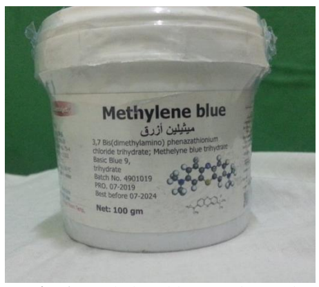
Fig. 1: Methylene blue powder used at our institute.

Regarding the Technique of Sentinel Lymph Node Biopsy:Methylene blue dye 1% is used in SLNB, (100gm bottle powder cost 225-pound Algomhria company) (fig.1). The technique is simple; Intraoperative after induction of anesthesia, 5 ml of 1% dilute methelyne blue is injected retoareolar(fig.2). After 15-20 minutes a small incision (2-3 cm) is placed in the axilla 1cm below the hair line.