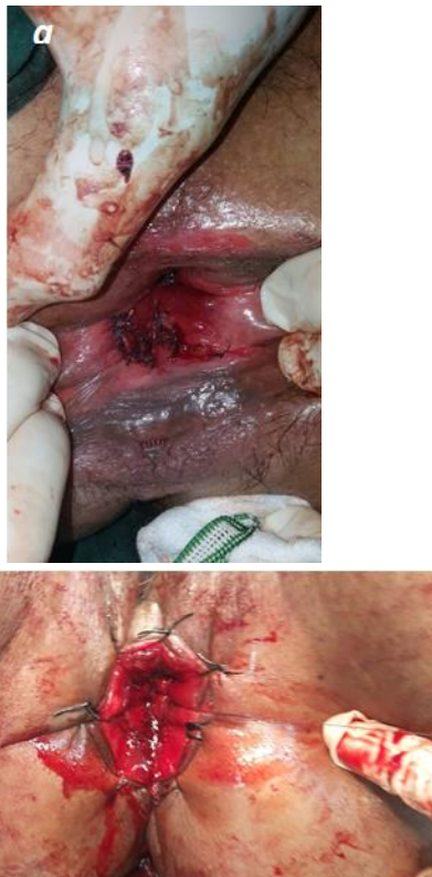
Fig. (3): Delayed colo-anal anastomosis stitches after excision of the excess colonic stump (a), spontaneous sloughing of the excess colonic stump with just debridement of the residual stump at the level of pectinate line (b).

After tying off the mesocolon at the level of the anal verge, the colonic pull-through segment was cut, to preserve the adhesions between the colonic serosa and the anal canal, hand-sewn colo-anal anastomosis was then performed using interrupted absorbable sutures (3/0 Vicryl) (fig. 3a), and sometimes it was not necessary to take stitches and just debridement of the excess colon at the level of pectinate line was enough (fig. 3b).